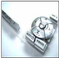
Automotive Keypad and Car Radio Module 7%