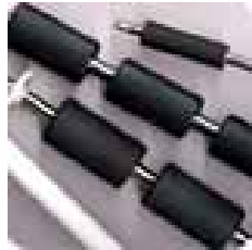
Office Automation parts 2%