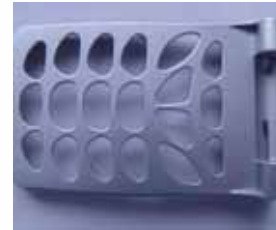
Mag-alloy Casing 4%